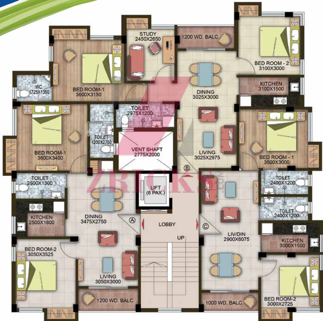
TYPICAL FLOOR PLAN (1st, 2nd and 3rd)

Come to 4Sight Ixora, and make your living a grand experience.