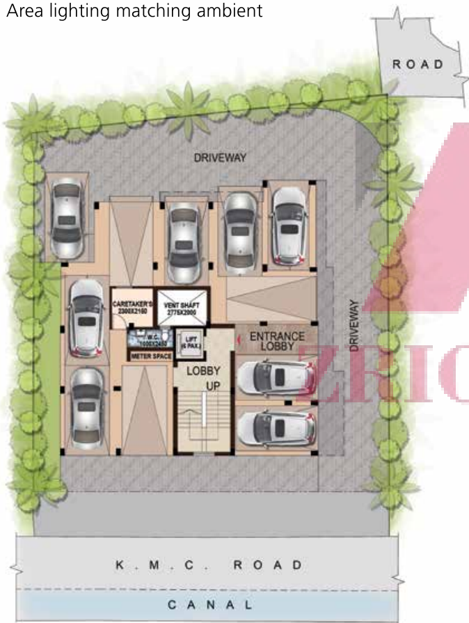
On Site Ground Floor Plan

RCC frame structure with isolated footing | 24x7 water supply | DG backup | Spacious lobby with marble finish | Vitrified tiles for flooring | Ceramic tiles for kitchen and toilet walls | Granite kitchen counter top | Parry ware or equivalent toilet fittings | ESSES or equivalent CP fittings | Laminated flush main door | Laminate backed toilet door | Anodized aluminum sliding window with glazing and grills | OTIS, THYSSEN or equivalent passenger lift | Individual letter box at ground floor | Area lighting matching ambient